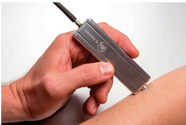
➤ Handheld probe for mobile Raman measurements.

This system was developed within the framework of the iCampus Cottbus.